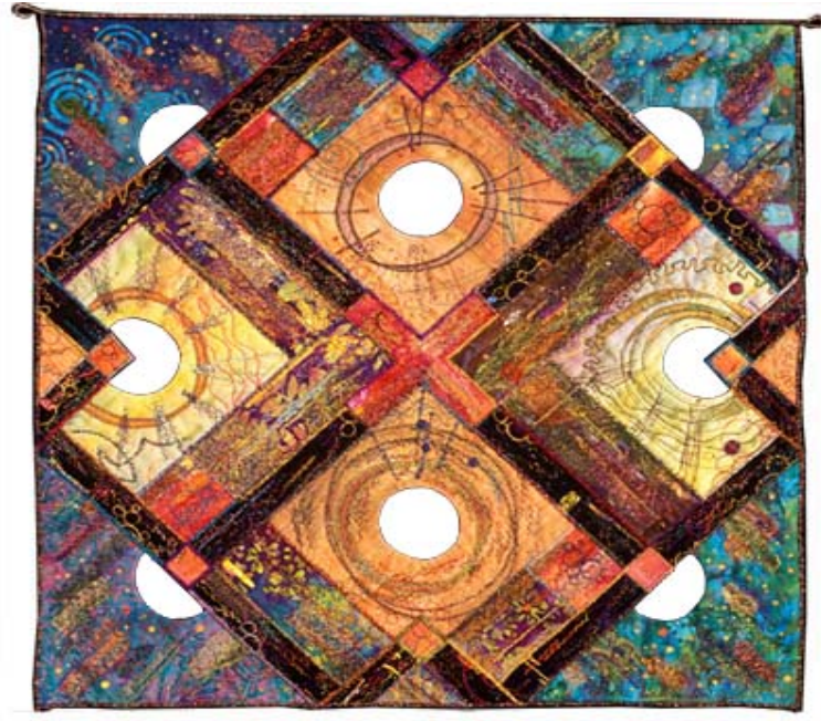
(Fig-2.9) Resolution-2001 [3]

technical problems during the art process.