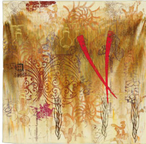
(Fig-2.6) Riding the Tide -2005 [3]