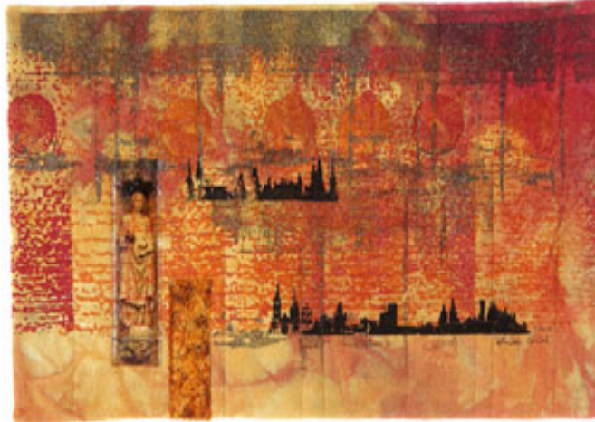
(Fig-2.4) Artifice -2004 [3]