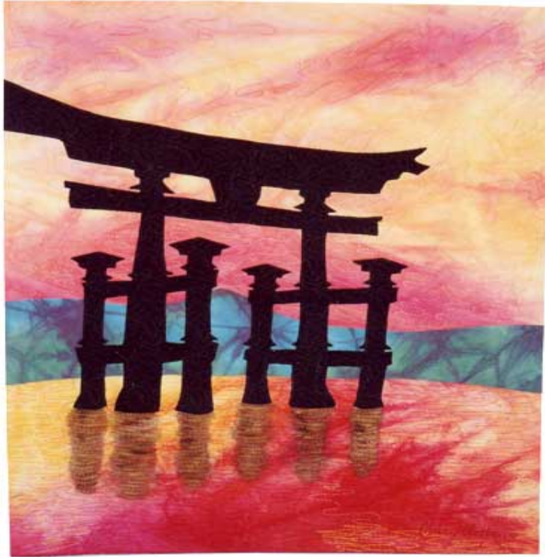
(Fig-2.2) Torii Gate-2003 [3]