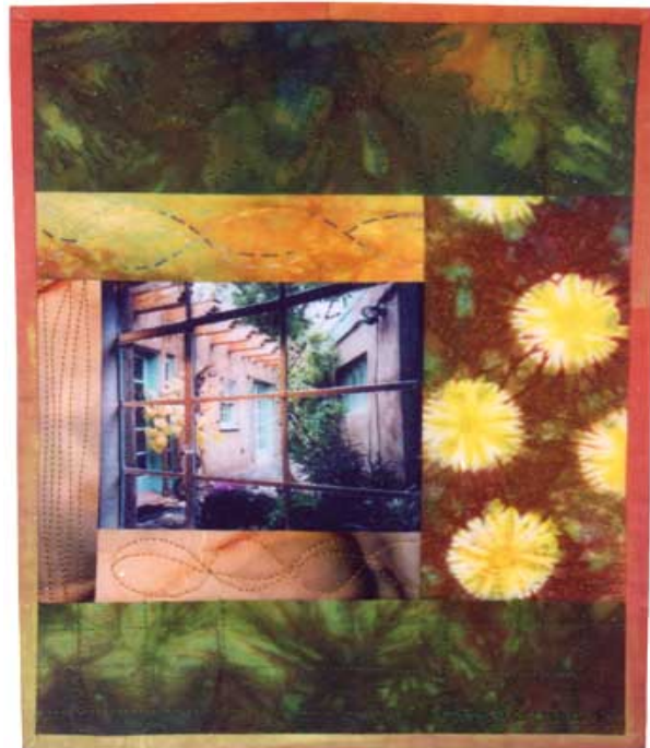
(Fig-2.3) Santa Fe-2003 [3]