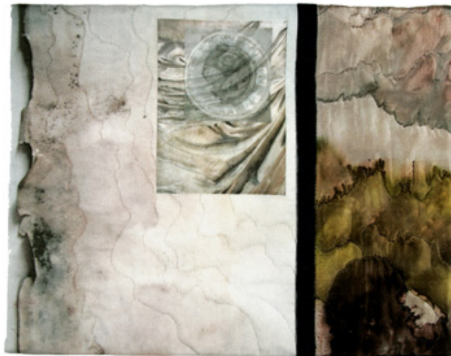
(Fig-2.5) The Edges of Illusion [3]