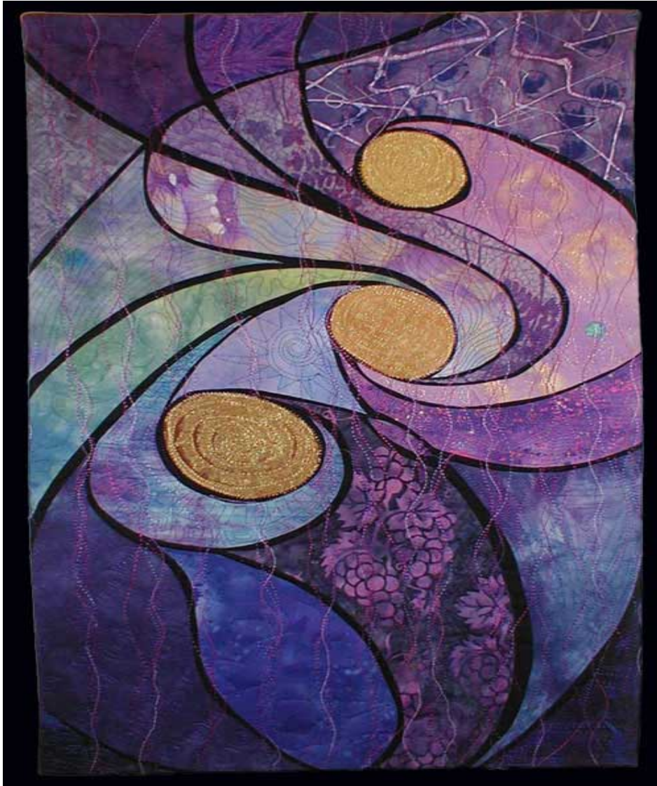
(Fig-2.8) Cocoon #3-2003 [3]