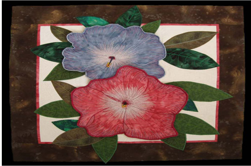
(Fig-2.7) Hibiscus-2005 [3]