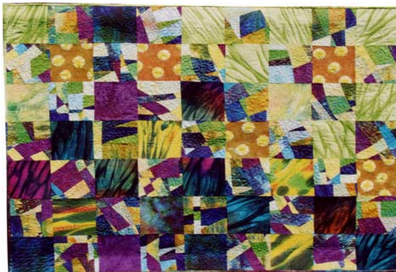
(Fig-2.1) Awakening-2004 [3]

Her inspiration is “photographs”. Most of these photographs she takes herself of the places that she visits or sometimes find them in old photo albums. She worked on different cultures, like African, Asian, and Australian culture. The addition of a photograph or part of one helps to tell the story of the piece that she creates. These photos are transferred to fabric, manipulated or cut up. Machine and hand thread work hold the piece together and finish it up with the final details.