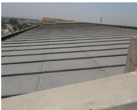
Figure 7: Roof Covered With copper Sheet

The first and second meetings of experts in May and August 2003, on the conservation of Shish Mahal were a sincere move by UNESCO, the Norwegian Government and Government of Pakistan. That was to acknowledge the fact that the proficiency of architects, archaeological engineers, archaeological chemists, planners and other specialists in the field of conservation and exchange of other expertise provided a sustainable conservation strategy for Shish Mahal. On the recommendations of the experts the conservation of Shish Mahal ceiling was carried out from 2003-2005 [19].