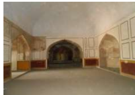
Figure 4: Basement Chambers towards West

There are two basements under Shish Mahal. The first basement was constructed by his father Jahangir. Shah Jahan constructed Shish Mahal and Naulakha Pavillion on the top of basement chambers.