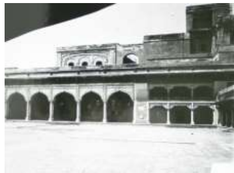
Figure 6: Additional Rooms Over Shish Mahal (Sikh Period Additions)

The roofs of the entire building were made water tightened along with kankar lime plaster applied to the wall etc. Some of the mirror work along with gilding work was carried out in the main veranda. The original niches/panels in one of the main verandah were also opened by removing the later period addition to exposure the paintings underneath [18].