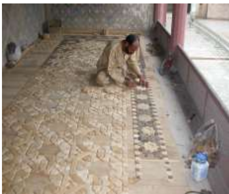
Figure 10: Inserting Floor Elements

The Façade of the Entrance gateway to fore court of the Shish Mahal has also been restored by the Punjab Archaeology in 2009. The Brick imitation and Fresco painting on Façade has also been done. The joints of the entire red sand floor around the Main Mirror hall and southern verandah were treated with stained lime mortar and marble Dado panels of summer and winter pavilions were preserved with new marble motives to check further deterioration. The roof top of North east pavilion was also restored and all the termite eaten beams were replaced by new ones after termite treatment.