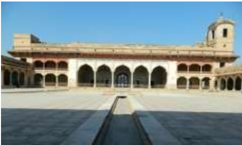
Figure 2: Front Elevation of Shish Mahal Lahore Fort

Shish Mahal has a rectangular main hall with several rooms on both sides as well as on the back side. From front it looks like a linear building. Main veranda of Shish Mahal is 26.5 ft wide and 67.5 ft long. At back there is 30.5 ft x 15 ft room and 15.5 ft x 15.5 ft hexagonal chambers on its both sides. Overall area of Shish Mahal is in square form.