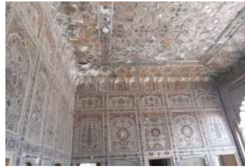
Figure 3: Mirror work in Main Varanda of Shish Mahal

The main decorative features of Shish Mahal are as follows: The Aina Kari or mirror work with stucco tracery, Gild work (placing of pure gold), Pietra dura work, specially in the spandrels of the arches and on the bases of the double columns which carries multi-cusped arches [10].