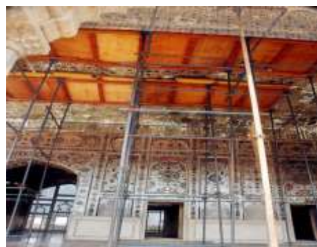
Figure 9: Ceiling Treatment

The department of archaeology undertook conservation and restoration project with the financial assistance of NORAD and UNESCO [20].