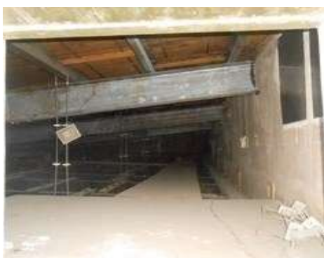
Figure 8: Double Roof with Supporting Hangers

The newly restored roof top of Shish Mahal covered with copper sheet urgently requires to be provided the Lightning proof arrangements to avoid any natural disaster like 1904 lightning incident.