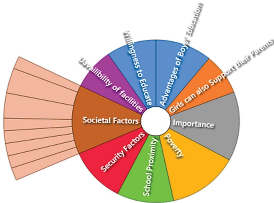
Figure 1: Themes