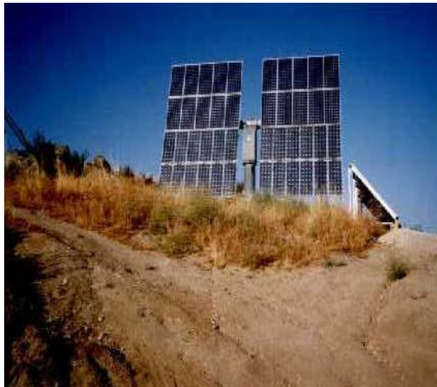
Figure 1.2: Solar Panel

An easy method to collect the sun's energy is photovoltaic conversion, this consists of the transformation of solar energy to electric energy using solar cells. Solar cells are manufactured from pure silicon with some impurities of other chemical elements, and they are each able to generate from 2 to 4 Amps, at a voltage of 0.46 to 0.48 V, using solar radiation as the source. [2] They capture both direct and diffuse radiation; this means that energy can be generated even on cloudy days. The cells are mounted in series to form PV modules in order to reach a suitable voltage for electrical applications; the PV modules collect the solar energy transforming it directly in electric energy as direct current, which, in isolated applications, it is necessary to store in batteries in order that it may be used during periods of the day in which there is no sunlight. [3]