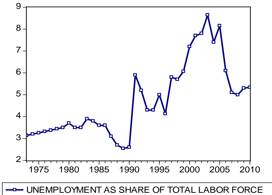
FIGURE NO. 1

Unemployment is has great importance among the macroeconomic problems. If any country experiences unemployment, it will not only put negative impact on the economic indicators of that country but, it will also hurt the social norms of such country. In case of Pakistan; the unemployment was 3.14 percent in the year 1973; it increased to 3.7 percent in the year 1980, then it started declining and became 2.55 percent in the year 1989. After the year 1989; the unemployment started increasing and it reached to its highest level 8.64 percent in the year 2003. Afterwards, the unemployment rate reaches to 5.34 percent in the year 2010. The trends of unemployment may be viewed from the figure no. 1 for a case of Pakistan.